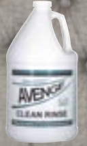
Avenge Clean Rinse Concentrated neutral extraction formula.