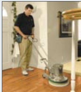
▲ Rotary Floor Machine

Apply RTU Wood Cleaner to the floor and remove the remaining soil with a Microfiber Bonnet . Allow the floor to dry naturally (no air movement).