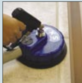
▲ SX-7 hand tool