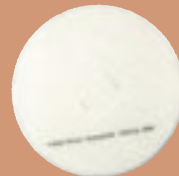
▲ 16" White Buffing Pad Cushions the maroon pad, limiting abrasion in the cleaning process. Increases the shine of a floor after the floor has cured or has been cleaned without the maroon pad .