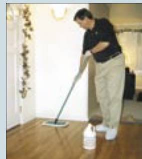
▲ Applying Bridgepoint Wood Finish

Allow the floor to dry naturally (usually 30 minutes.) Apply a second coat of Wood Finish . Allow floor to dry naturally.