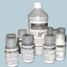
▲ Clear Grout Sealer and dyes