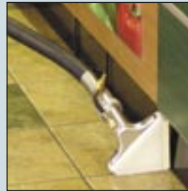
▲ Gekko with Edging/Coving Tool

Use the Gekko stand-up tool for edging and direct blasting of grout. Use the SX-7 for tight spots, countertops or vertical surfaces.