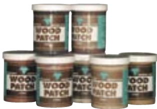
▲ Bridgepoint Wood Patch

Repair damaged areas using Bridgepoint Wood Patch . Deep scratches and large separations need to be filled.