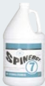
▲ Spinergy 7