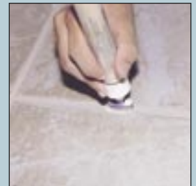
▲ Turbo Stick grout sealing tool