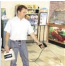
▲ Hydro-Force Revolution

IMPORTANT: Dilute according to directions. Carefully read and follow all instructions on the bottle.