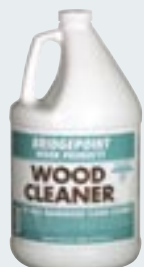
◀ Bridgepoint Wood Cleaner