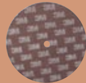
▲ 16" Maroon Scrubbing Pad Cleans the floor and creates more surface area in the existing finish to promote bonding of the Bridgepoint Wood Finish .