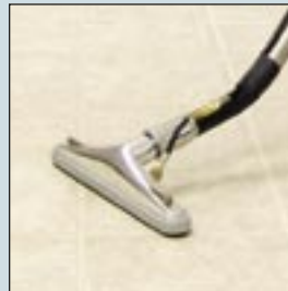
▲ Gekko floor tool