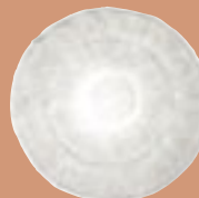
▲ 17.5" Microfiber Bonnet

Wood Finish Applicator ▼ Used with AX16 ( Terry Cloth Cover ) to clean wood floors and to apply finish.