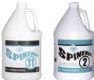
▲ Spinergy 11